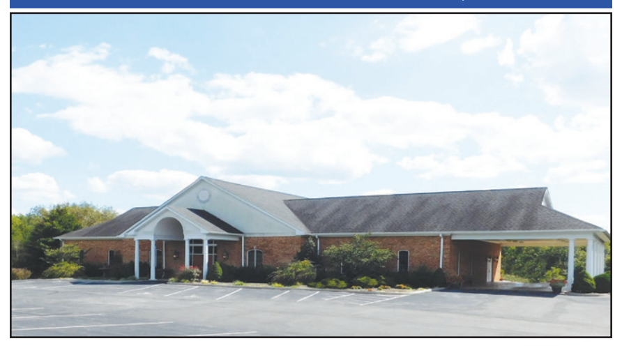
Puckett Funeral Home located on Milnwood Road.