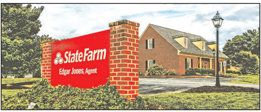
Pictured is the State Farm Insurance, Edgar Jones Insurance Agency, Inc. in Farmville.