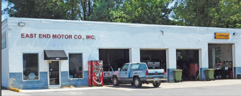
East End Motor Company - Two locations on East Third Street