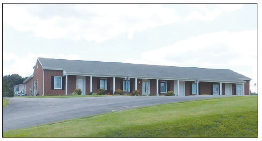
Pictured is the Shorter Funeral Home building located on South Main Street in Farmville.