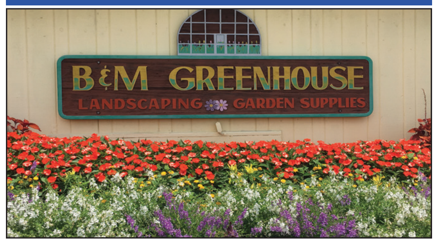
Pictured is B & M Greenhouse.