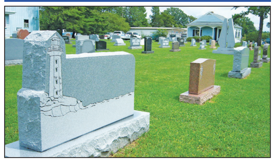
Pictured is Simmons Monument Company located in Crewe. Virginia.