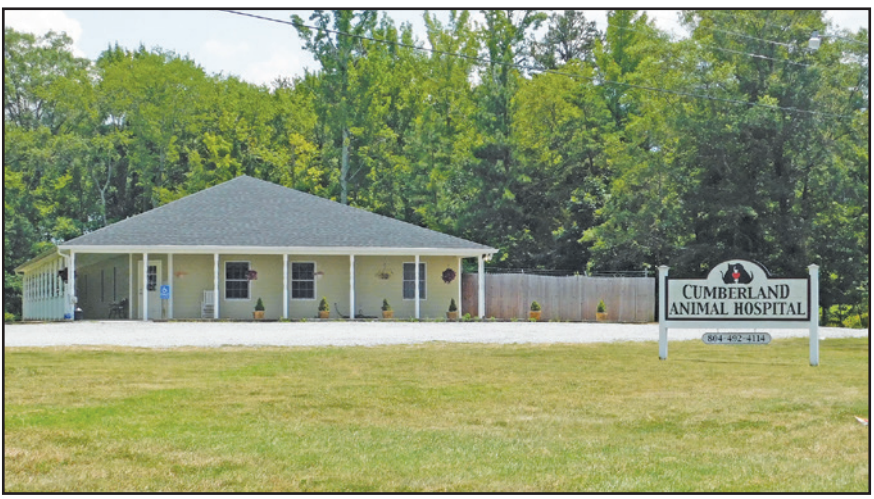
Cumberland Animal Hospital new facility located at 24 Hillcrest Road, Cumberland.